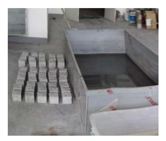
Fig. 1. Specimen of concrete