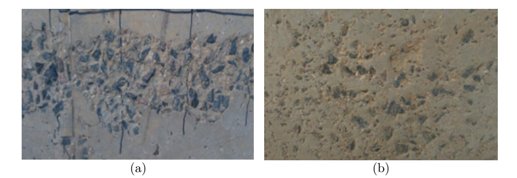
Fig. 2. freeze-thaw damage of pier