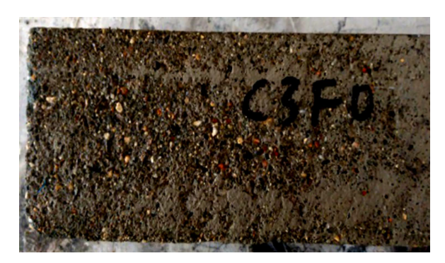
Fig. 4. 100 freeze-thaw cycles picture of damage in laboratory

maximum number of freeze-thaw cycles is about 300 times, that is, the ultimate life is